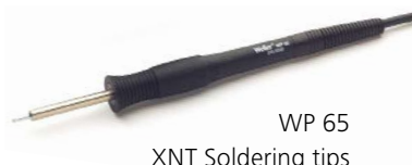
WP 65 XNT Soldering tips