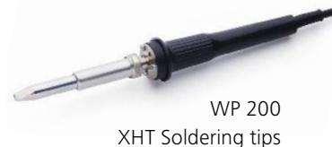
WP 200 XHT Soldering tips