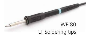
WP 80 LT Soldering tips