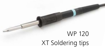
WP 120 XT Soldering tips