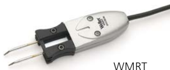
WMRT RTW Tips