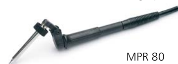
MPR 80 LT Soldering tips