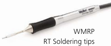
WMPRP RT Soldering tips