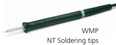
WMP NT Soldering tips